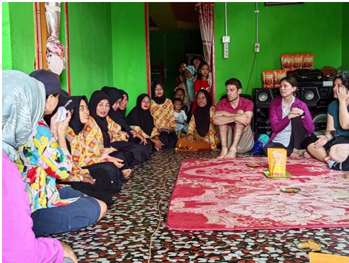
Figure 3 - Monitoring visit to a local women's group

During a monitoring visit, the women's group testified that without the milkfish products (crackers and floss), they do not have additional income nor other significant economic activities. Although not yet in scale, they have seen increase in their income and were very proud to say that they have extra income to provide for the family and even to treat their husbands. To us, the empowerment they felt is an alleviation beyond mere poverty measures.